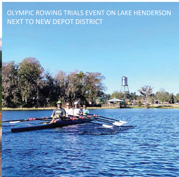
OLYMPIC ROWING TRIALS EVENT ON LAKE HENDERSON NEXT TO NEW DEPOT DISTRICT