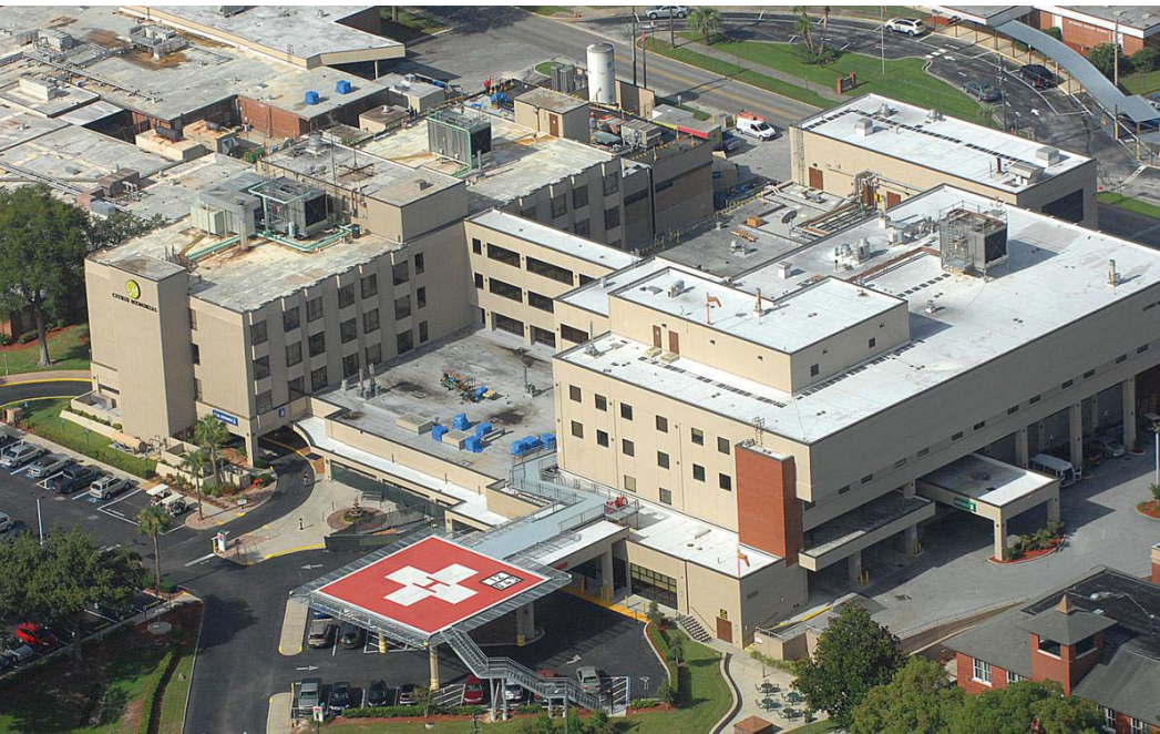
Citrus Memorial Hospital

Located Less Than one Mile From Subject Property