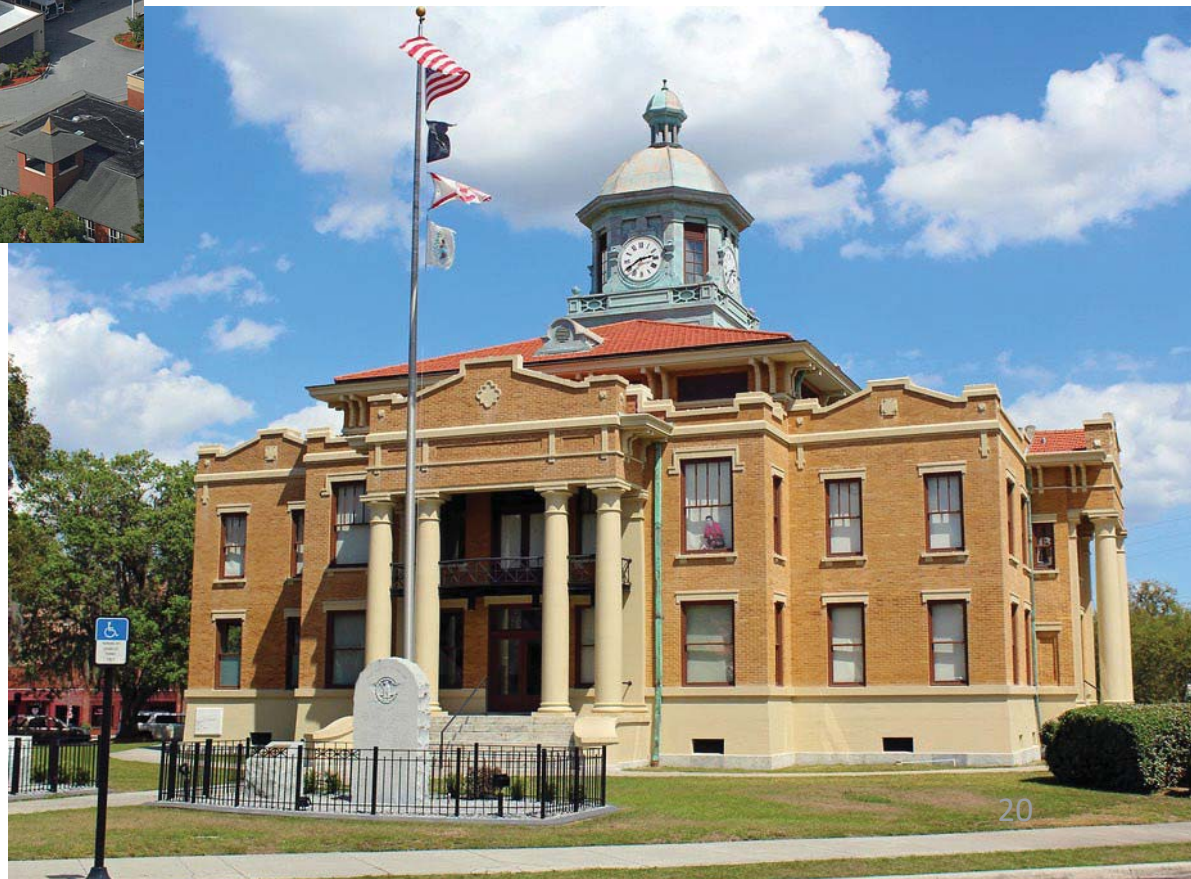
Old Courthouse Heritage Museum

Located Less Than one Mile From Subject Property