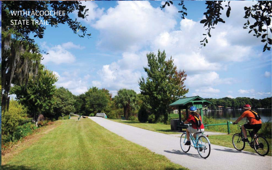
WITHLACOOCHEE STATE TRAIL