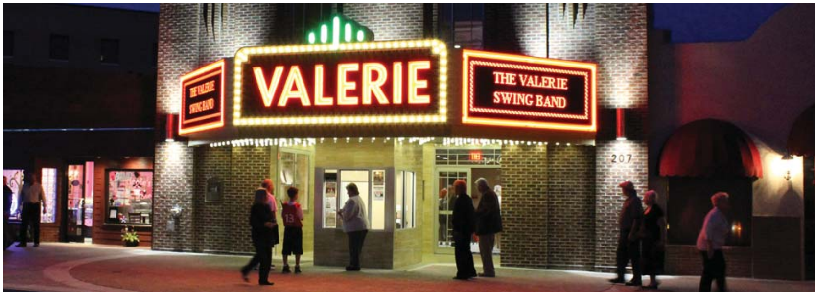
Historic Valerie Theatre